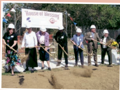
2008: Groundbreaking ceremony for the House of Blessing