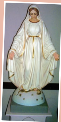
Blessed Mother statue given to the sisters by Civil War soldiers