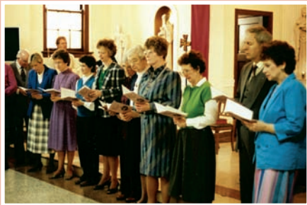
1987: Benedictine Associates Program