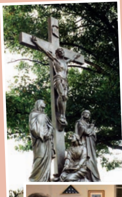
2002: Cemetery renovation