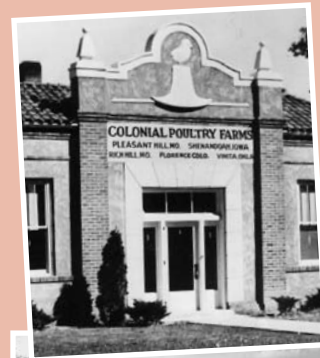
1949: St. Joseph Hospital, Florence, Colorado, before (left) and after (below)