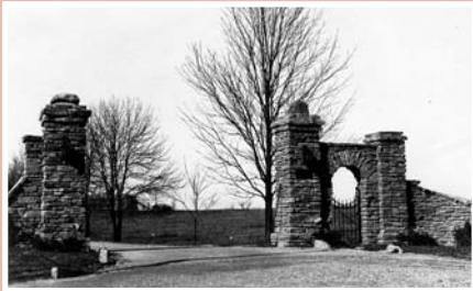
1931: Stone gates at Villa Madonna grounds