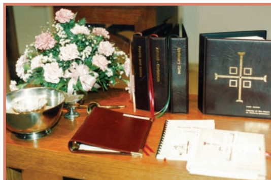
1991: New Liturgy of the Hours Books