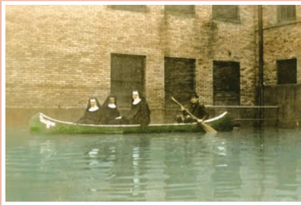
1937: Flood at St. Benedict's School, Covington, Kentucky