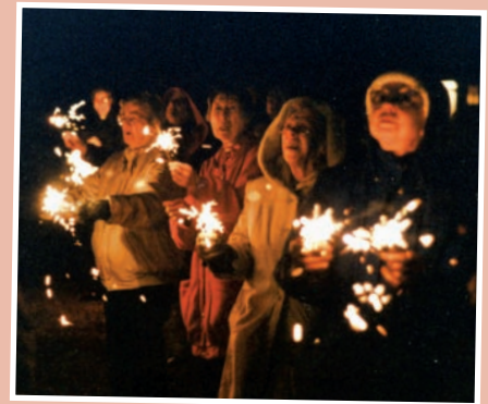
2000: Millennium Celebration