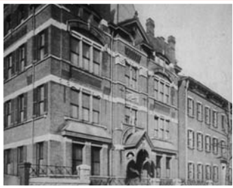
St. Walburg Academy and Monastery, 12th Street, Covington, Kentucky