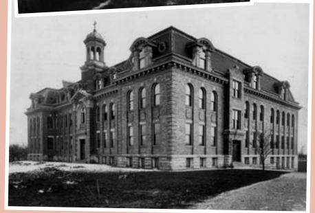
1907: VMA building