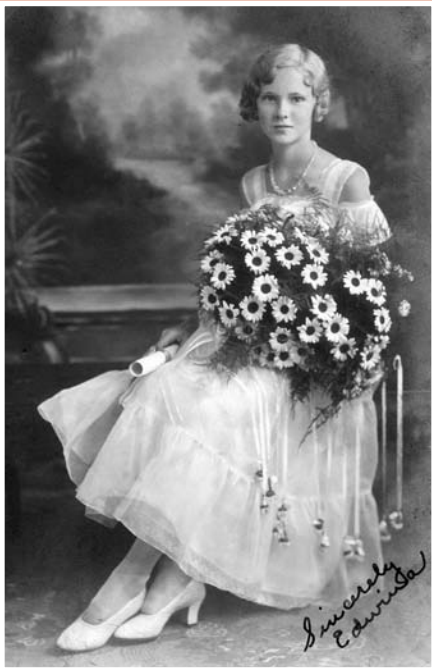
1931: One of the last graduates of St. Walburg Academy