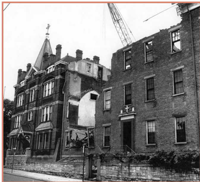
1969: Demolition of Original Monastery