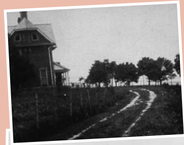
1903: Collins House & Farm