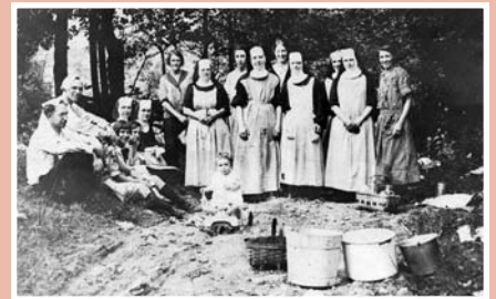
Berry Pickers (date unknown)