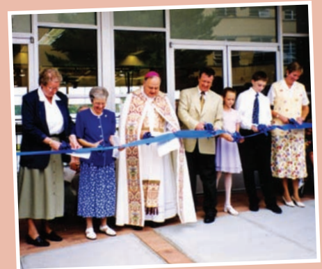
2000: Dedication of the VMA athletic center

Below: Center of Spirituality Day of Reflection