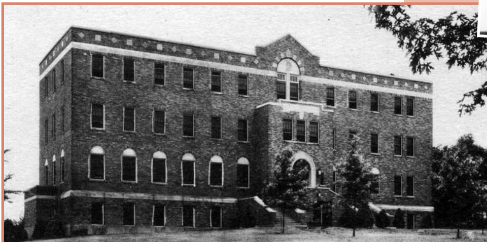
1937: St. Walburg Monastery, 2500 Amsterdam Road